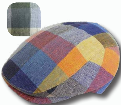
236 Pure Linen Colors: Orange Plaid, Aqua Plaid Sizes: S - XXL