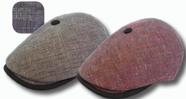
217 Linen/Cotton/Silk, Suede Trimming Colors: Beige, Rust, Navy Sizes: S - XXL