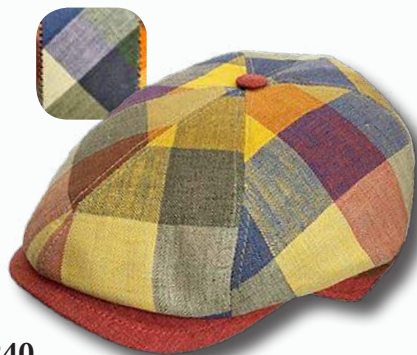
240 Pure Linen Colors: Coral, Aqua Sizes: S - XXL