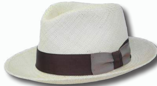
Charleston *Also Available in Bleach Brim: 2 1/2" Sizes: S - XXL