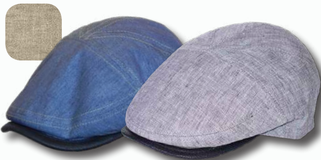
219 Pure Linen, Leather Trimming Colors: Blue, Grey, Tan Sizes: S - XXL