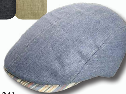
241 Pure Linen Colors: Blue, Black, Tan Sizes: S - XXL