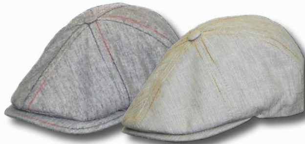
216 Pure Linen Colors: Grey, Tan (Multi-Color Stitching) Sizes: S - XXL