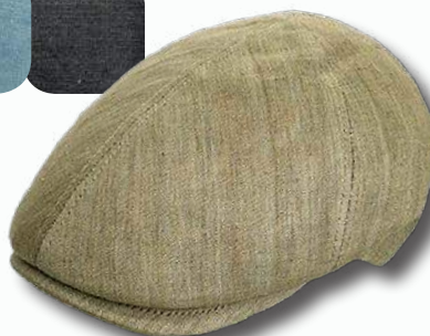
242 Pure Linen Colors: Tan, Blue, Black Sizes: S - XXL