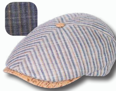
223 Pure Linen, Cork Trimming Color: Beige, Indigo Sizes: S - XXL