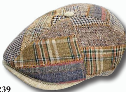
239 Pure Linen Colors: Patchwork Sizes: S - XXL