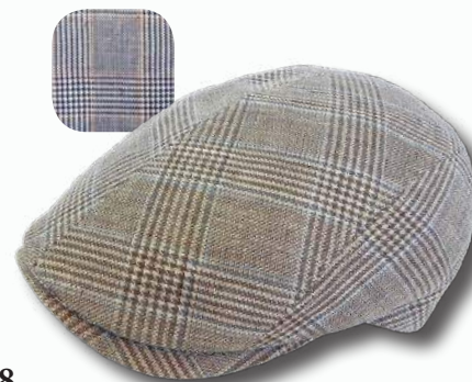
238 Linen/Cotton Colors: Tan, Blue Sizes: S - XXL