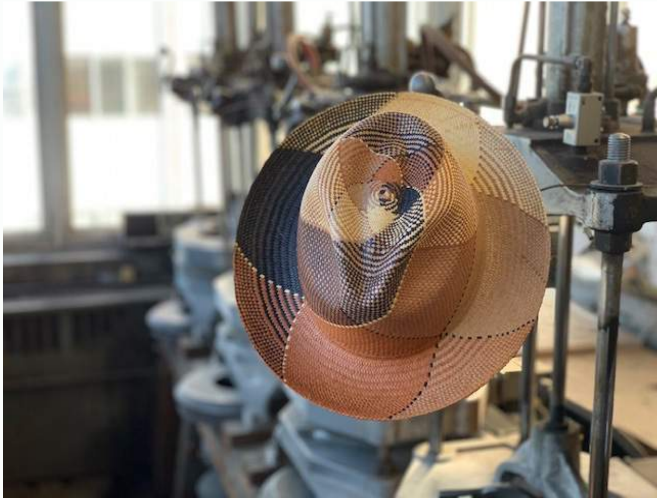
Bentley Pg 4