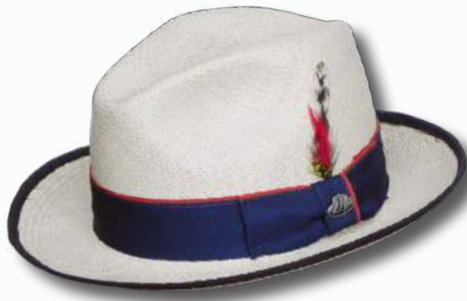
Vienna Brim: 2" Sizes: S - XXL